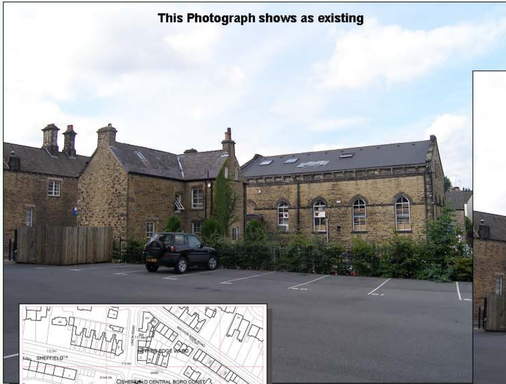
This Photograph shows as existing